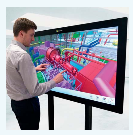
Exploring and understanding a complex 3D model of a power plant is simplified using AVEVA Engage and Microsoft touchscreen technology.