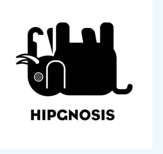
Hipgnosis Songs Fund

Hipgnosis Songs Fund (SONG) is a listed investment company that buys and owns the rights to music royalties. SONG owns the rights to approximately 7,500 songs performed by a diverse range of artists including Beyonce, Ed Sheeran, Eurythmics and Justin Bieber. Through the collection of royalty revenues on the songs in its portfolio, which typically last for the life of the author/artist plus another 50+ years, SONG is targeting a 10%+ net total return inclusive of a 5% dividend yield. One of the key attractions of the investment is that the primary return driver, mainly the growth in music streaming platforms such as Spotify, Tencent and Apple Music, is largely uncorrelated to other return drivers within the Company's portfolio.