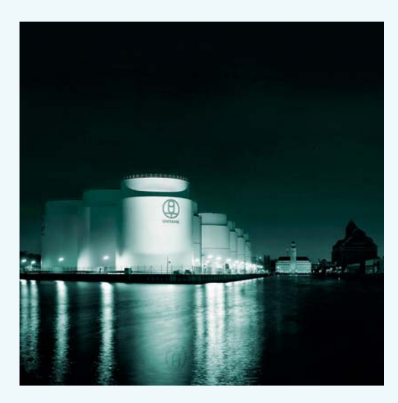
Unitank – a liquid oil storage business operating across Germany and Belgium